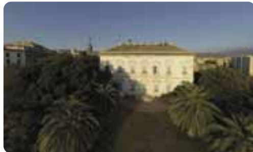
Museo d'Arte Contemporanea di Villa Croce

The Diocesano Museum, is inside the medieval building, which was came from the need to offer a historic memory of the Genoese church over the centuries. This was a testimony by means of the works of art of the rich relationship between the city and its territory.