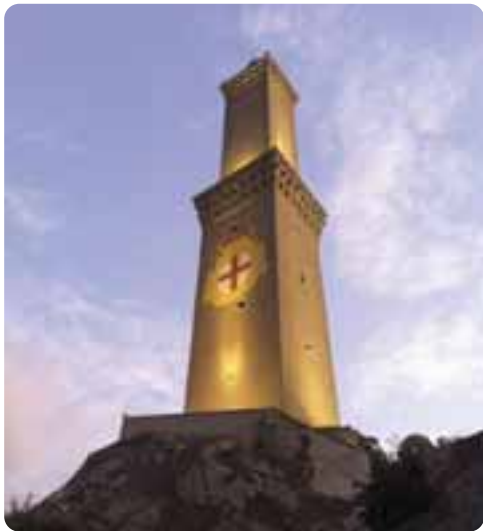
Lanterna di Genova

the city, the inner Museum of the ancient fortifications and the lighthouse tower up to the first panoramic terrace and its beautiful 360 degree view over the city and its docks ( www.lanternadigenova.it ).