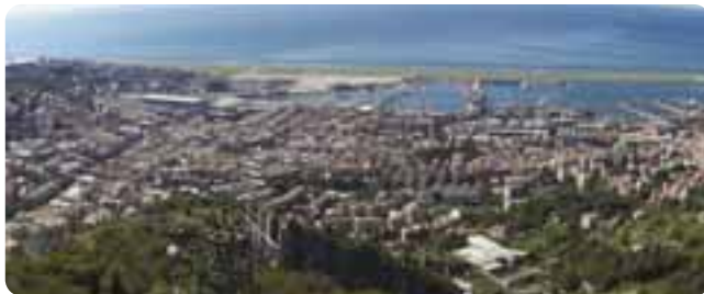
Panorama dal Santuario