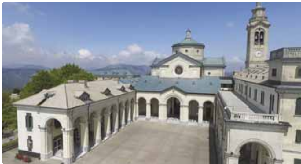
Santuario Nostra Signora della Guardia

This devotion grew greatly and rapidly so much so that within 10 years the first sanctuary was built, but it was not big enough to host all the faithful. In 1890 the Basilica which stands there now was built with the aid of the people, hard work, and men from the valley and the city.