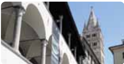
Commenda di Pré