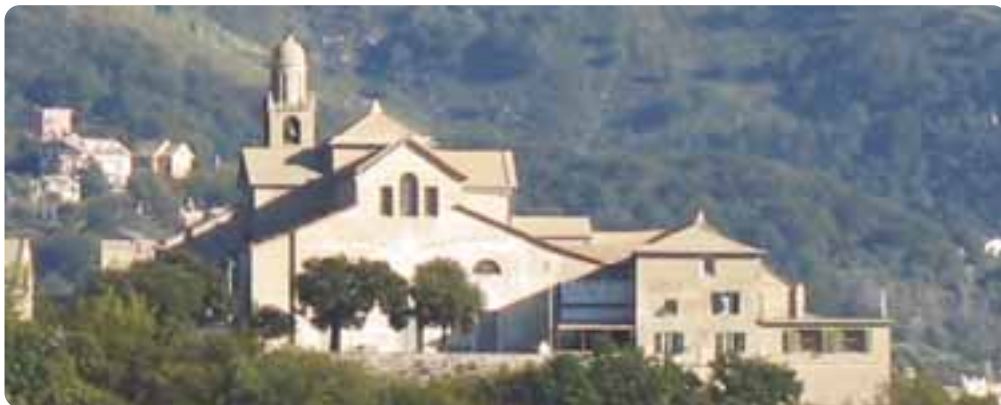
Santuario Nostra Signora del Monte