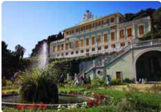
Parco Villa Duchessa di Galliera

In its grounds, besides a large Italian garden, there is a small theatre dated 1785, a romantic wood, a Neo-Romantic castle with grottoes and artificial waterfalls, olive trees, deer, Tibetan goats and a small sanctuary.