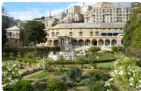
Palazzo del Principe

Chiesa di Santa Maria della Cella It was built in honour of Mary by the Doria Family at the beginning of the thirteenth century, according to tradition next to the ancient Cella di Sant'Agostino. The latter being a small medieval chapel which was to hold the reliques of the Saint on his way to Pavia in the eighth century. Due to this proximity it became known as Santa Maria della Cella.