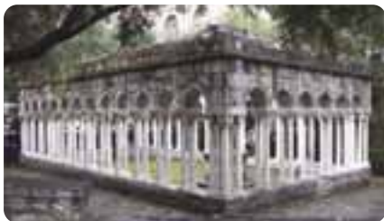
Chiostro di Sant'Andrea