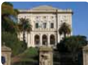
Villa Giustiniani Cambiaso