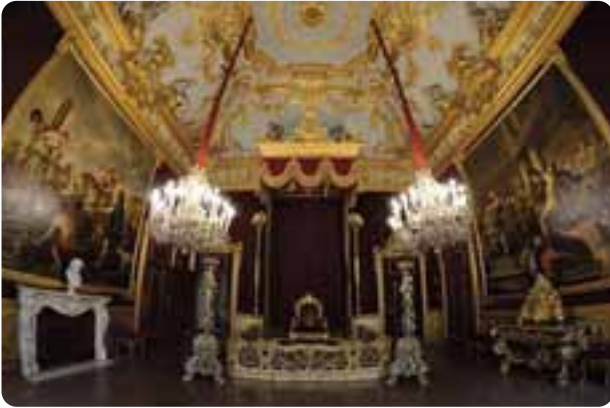
Museo di Palazzo Reale