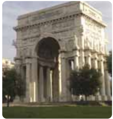
Piazza della Vittoria