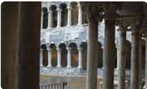
Chiostro del Museo Diocesano

In the 10th century the area of San Lorenzo became the heart of the expanding and changing city: in an urban centre lacking squares, the cathedral forecourt of San Lorenzo became a crucial setting for political and civil life during the entire Middle Ages.