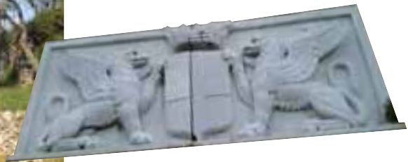
The Genoese Coat of Arms is sculptured in marble and placed at the base of the basin which regulates the Ponte Sifone di Staglieno.