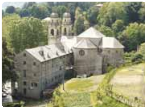
Santuario Nostra Signora dell'Acquasanta

Santuario Nostra Signora dell'Acquasanta e Terme di Genova