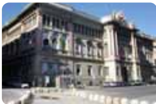
Museo di Storia Naturale