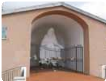
Santuario Nostra Signora del Gazzo

Over five metres tall, and in accordance with the spirit of the construction of the Cross, it was to be seen by the population so they would receive consolation.