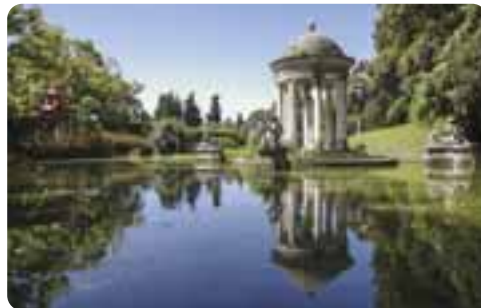
Parco Villa Durazzo Pallavicini

Michele Canzio on commission of Marquis Ignazio Alessandro Pallavicini. The Villa represents one of the most refined examples of a 19th century aristocratic holiday residence and at one time dominated the surrounding landscape because of its size. Unfortunately, post-war urbanisation ruined its importance by constructing high buildings on the marvellous orange groves and orchards that once surrounded it. The park was intended to be a romantic garden and a place for leisure and meditation with such a variety of landscapes that caused visitors to experience diverse and contrasting emotions. Indeed, the idea the architect had was of a succession of well-structured groups of three dimensional scenic designs which made the park one of its kind.